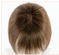
hair 10" bangs 5" 29 grams