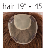
hair 19" • 45 grams