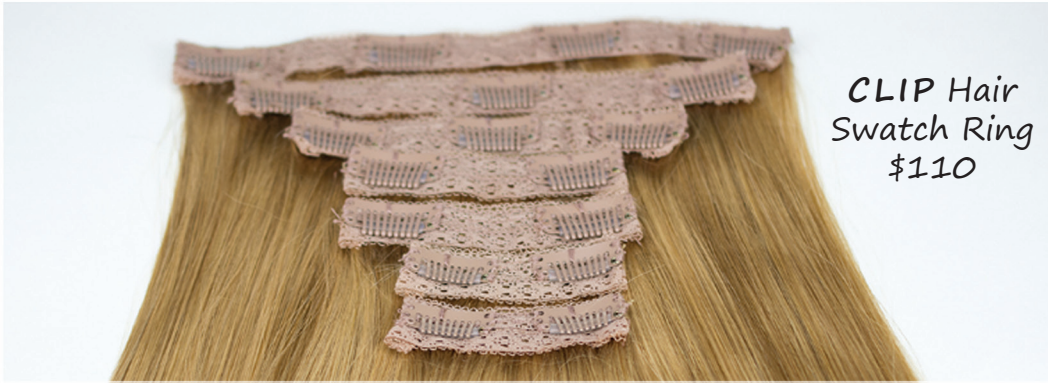
CLIP Hair Swatch Ring $110

Finest & softest 100% human remy hair. Blends naturally to any type of hair texture.