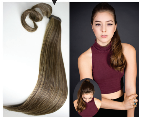
PONY WRAP Clip 18" Straight $32