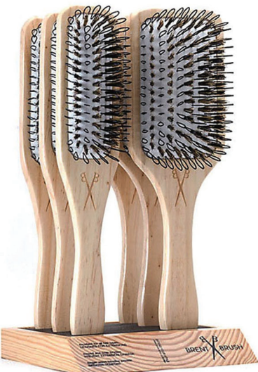
Spornette® BB Extension Brushes BB extend-a-style $20 BB extend-a-glide $25