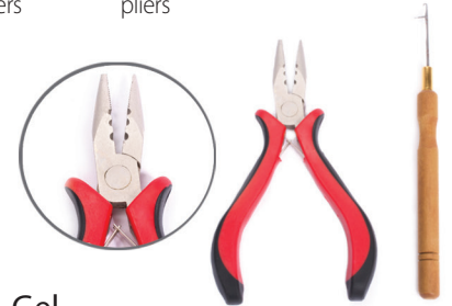
2 pc. Tool Set $15