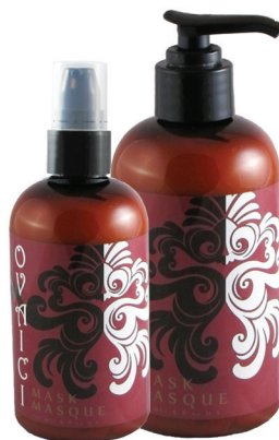
Mask 3oz $5.95 • 8oz $9.95 33oz $27.50