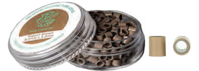
Premium Copper Tube Lock w/Silicone 4mm x 3.2mm 200 pcs. $20