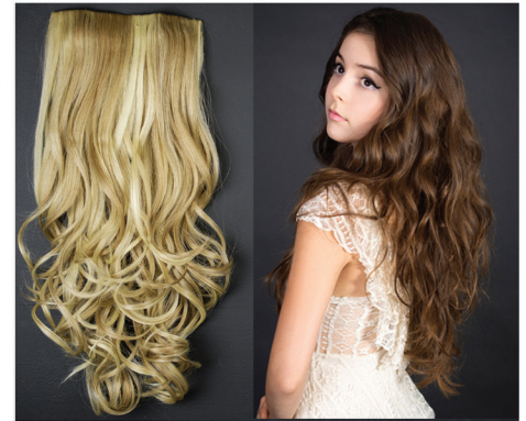
ONE PIECE Clip 20" Romance Wave $40

The COUTURE FIBER Latest in synthetic hair design. Can withstand heating tools. Lightweight, versatile, and has a natural look, feel, & flow.