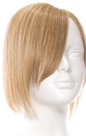
HAND-TIED MEDIUM ROUND MONO BASE