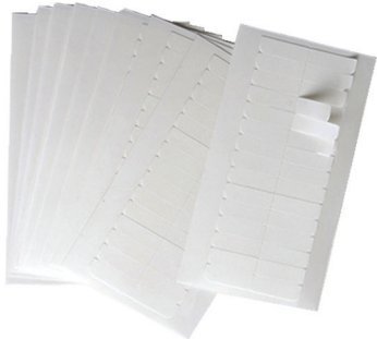
Replacement Tape 30 Tabs 1/4" thin $10 4cm wide $12