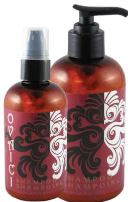
Shampoo 3oz $5.95 • 8oz $9.95 33oz $27.50

Extension hair care with chocolate, blueberries & argan oil