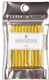
Keratin Glue Sticks 10 pcs $20