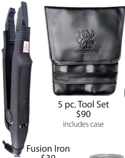
Fusion Iron $39