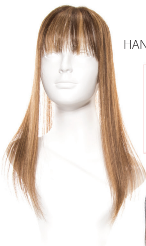
HAND-TIED LARGE BLUNT BANG MONO TOP