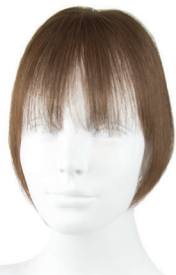
HAND-TIED SMALL RECTANGLE MONO BASE