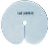
Guard Disks $2 each