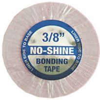
Replacement Tape Roll $9.95