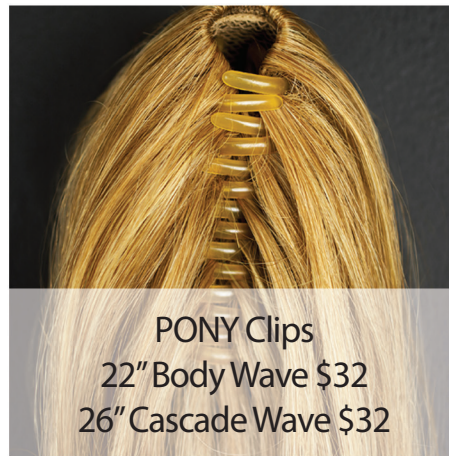
PONY Clips 22" Body Wave $32 26" Cascade Wave $32

The COUTURE FIBER Latest in synthetic hair design. Can withstand heating tools. Lightweight, versatile, and has a natural look, feel, & flow.