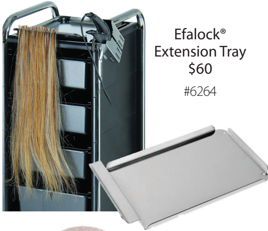
Efalock® Extension Tray $60 #6264