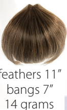
feathers 11" bangs 7" 14 grams