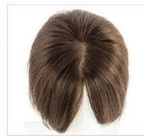
hair 11" 35 grams