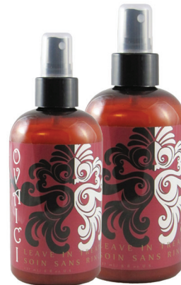
Styling Cream 3oz for $5.95 8oz for $9.95