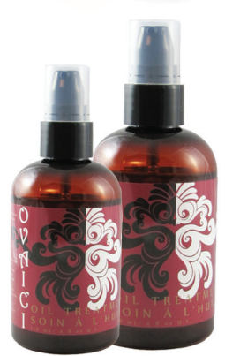
Argan Oil 8oz for $14.95 3oz for $8.95