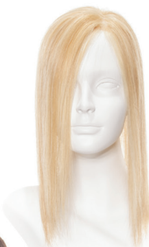
HAND-TIED FULL COVER MONO BASE