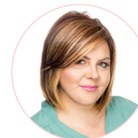
13 Pop'In Top Easy Bang