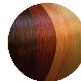
14 Color Chart