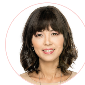
12 Blunt Bang