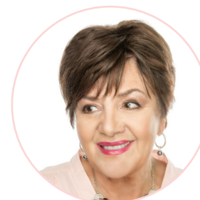
3 Natural Top Small Natural