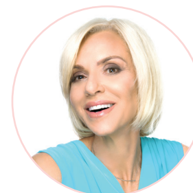
4 Natural Top Medium