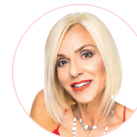
6 Natural Top Full