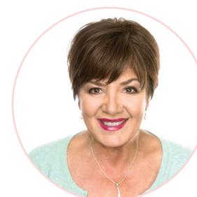
8 Secret Crown